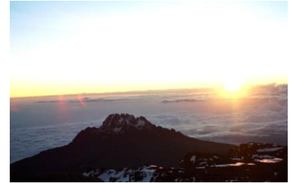
View of the sunrise over Mawenzi

It will take 6 or 7 hours to reach the crater rim. Sunrise on the summit crater is going to be something to remember forever. The sun rising over the plains of Africa and diffuse light highlighting the nearby glaciers is truly a world class experience. After a cup of hot tea, we will continue along the rim for another hour or two before reaching the highest point in Africa (19,340 ft). Congratulations!