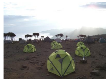
Sunset over Shira Camp

We start out at about 8 a.m. leaving the rainforest glades and enter alpine vegetation. In the distance we can see the first close-up of the snow-capped summit. This is a great day of gradual hiking through fields of heather. At around 10,000 ft. we begin to see the first Lobelia, Protea and giant Senecia plants. This is another 5 to 6 hour day. From our camp we will have breathtaking views of Kibo and Mt. Meru.