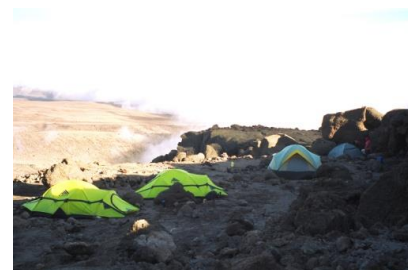
Barafu Camp, getting ready for summit day

The hike to Barafu is across a field of broken sedimentary rocks. We reach Barafu in about 4 hours. Here we will have lunch, and rest until dinner. Then we will sleep until midnight in preparation for following day's summit climb.